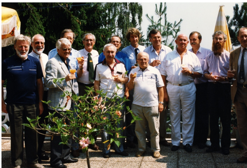
August 1991: First meeting of "Initiative Groupe Königstein"